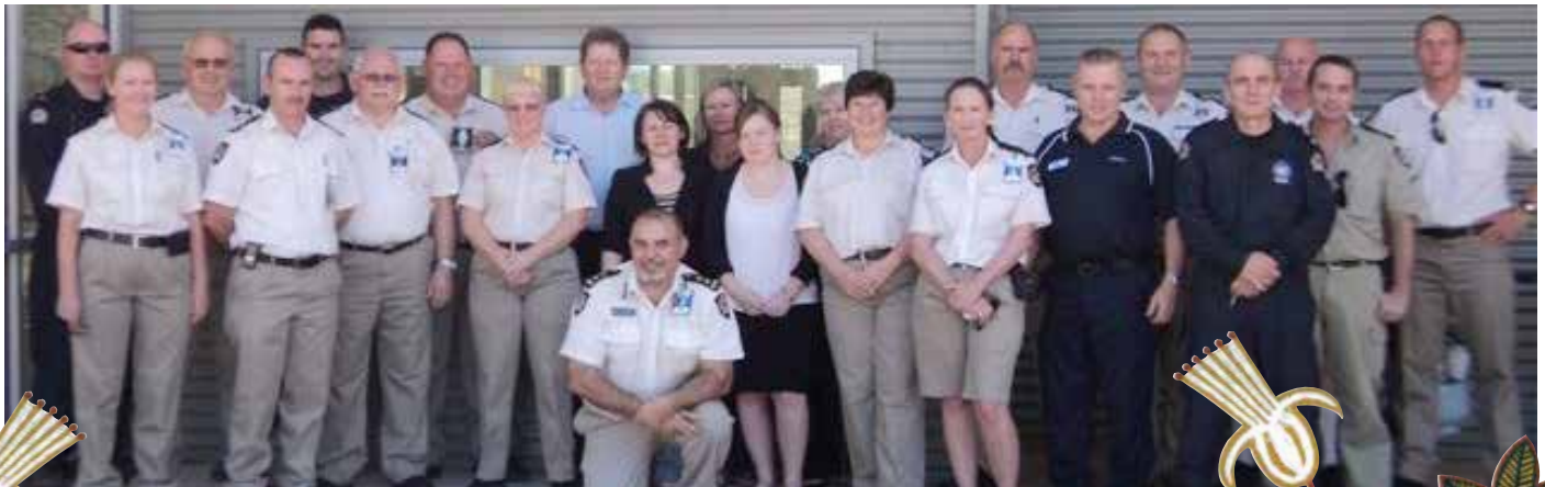
WKRP staff at the finished site.

"The completed site is very different to anything we've had at DCS before in both philosophy and design and provides an exciting future opportunity for the Department."