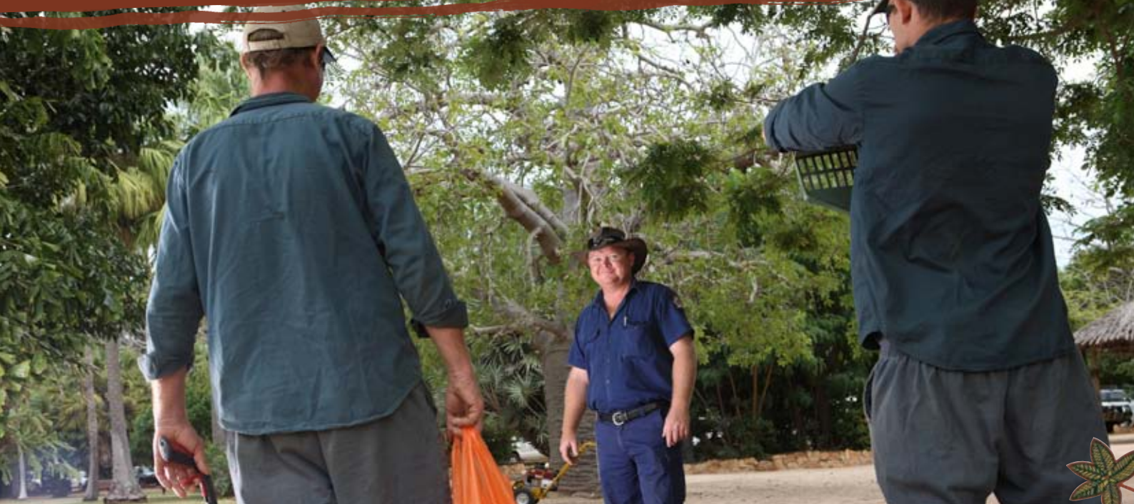
VSOs work with prisoners to increase their chances of finding a job on their release.